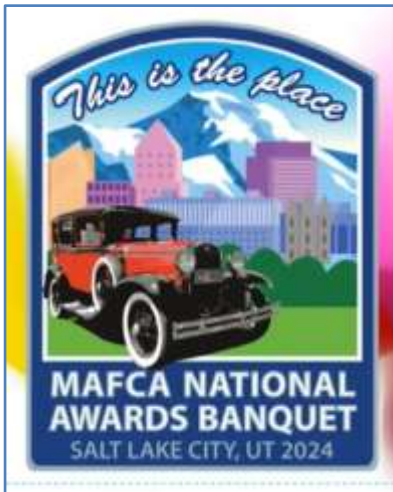
December 11-14, 2024 Salt Lake City, Utah