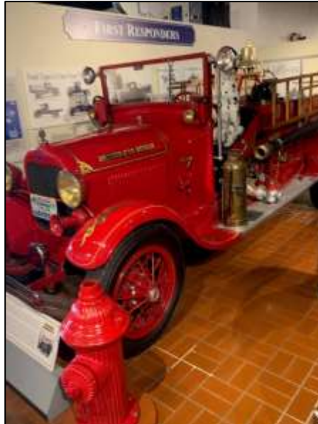
Fabulous fire truck in the First Responders display.