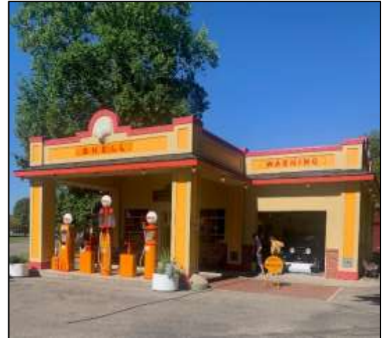
The iconic gas station.