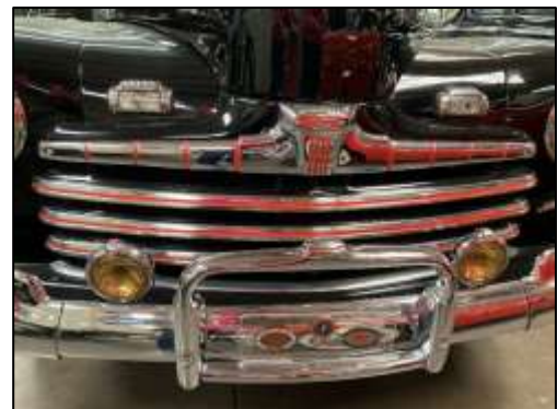
Can you say CHROME??