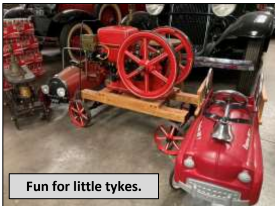
Fun for little tykes.